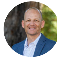
Kevin McCarty Mayor mccartyformayor.com